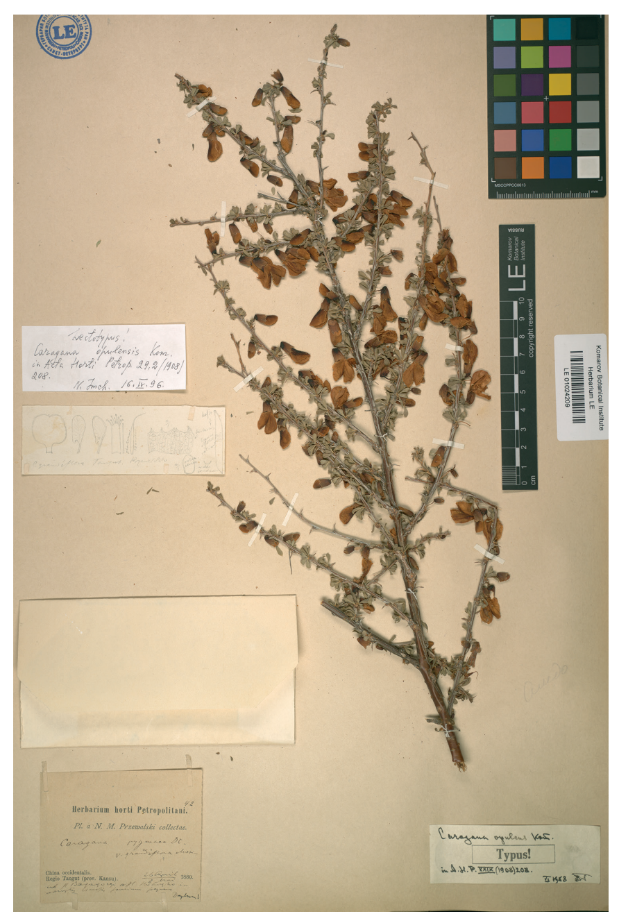
Figure 1. Lectotype of Caragana opulens Kom. (LE01024209). Komarov Botanical Institute, St. Petersburg, Russia (LE).

su: Bara-Topra, 11 May 1880, N.M. Przewalski s.n. (LE [barcode LE01024210, image!]). CHINA. Thibet [Tibet]: route de Lhassa à Batang, May 1890, Henry D'Orléans s.n. (P [barcode P02767097, image!]).