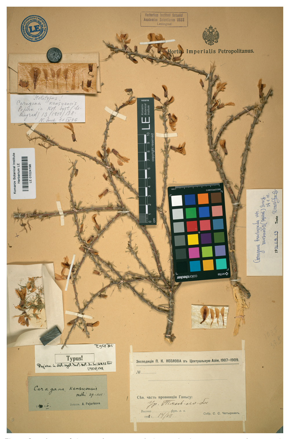
Figure 3. Holotype of Caragana kansuensis Pojark. (LE01024198) Komarov Botanical Institute, St. Petersburg, Russia (LE).