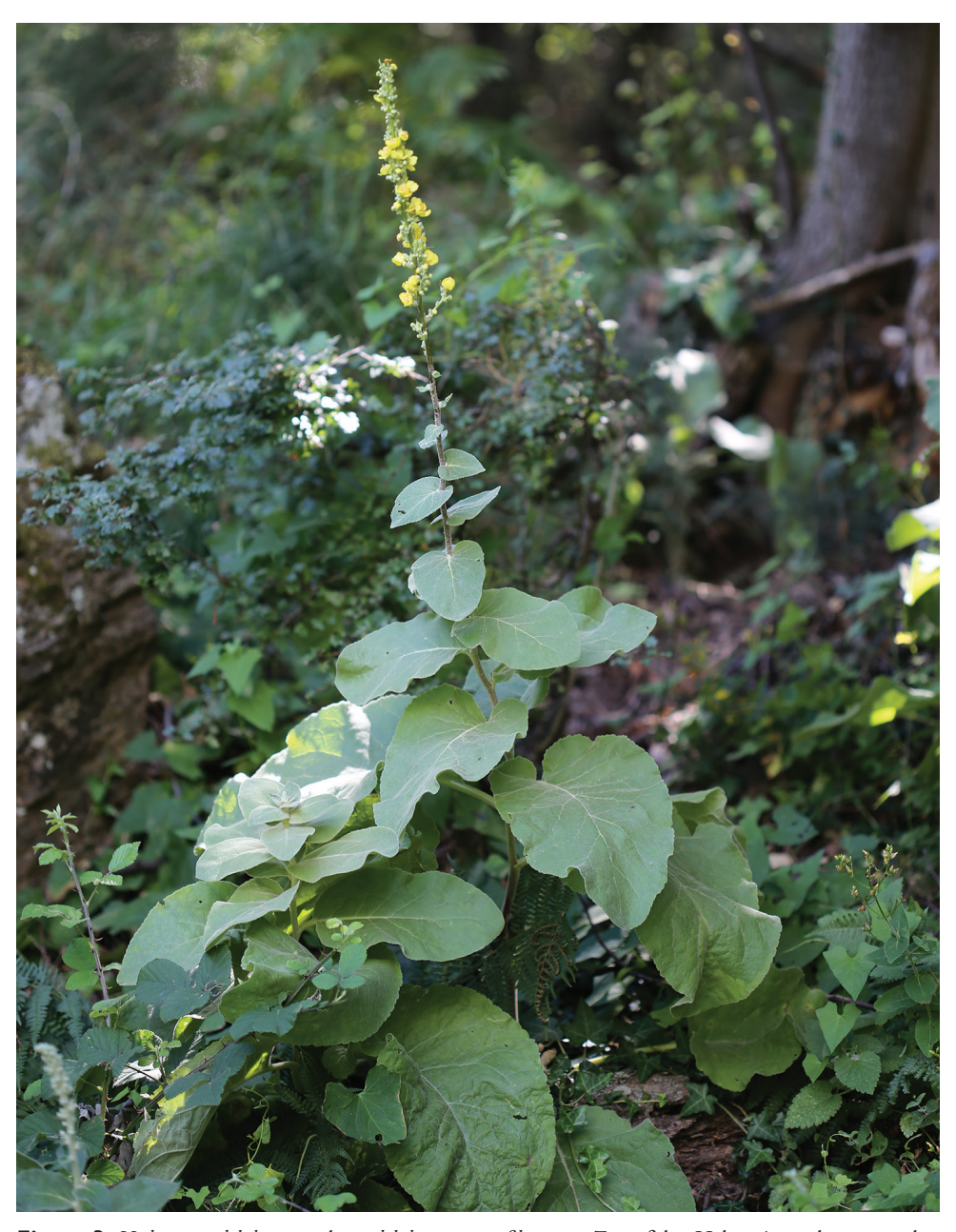
Figure 3. Verbascum delphicum subsp. delphicum var. filictorum Zografidis: Habit. A sterile stem is discernible next to the flowering stem.

petiole up to 15 cm of length; lamina ovate to widely ovate, 1.2-1.9 of length to width ratio, obtuse-truncate to cordate at the base, crenate, obtuse at apex; larger leaf laminas 16-40 \times 11-24 cm; middle cauline-leaves similar but progressively smaller and often subacute at the apex, shortly petiolate; upper cauline-leaves small, sessile,