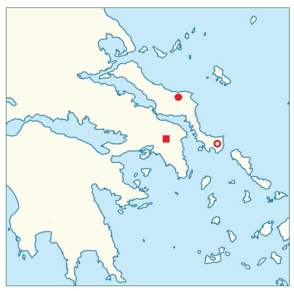
Figure 4. Distribution map of Verbascum delphicum : ■ subsp. cervi ; ●, ○ subsp. delphicum ; ○ var. filictorum .

severely affected. Importantly, the population size of V. delphicum subsp. cervi has been reduced about 20% over the last three years and the taxon is apparently critically endangered according to IUCN Red list criteria C(2a(i,ii)) and D(1) (IUCN 2001).