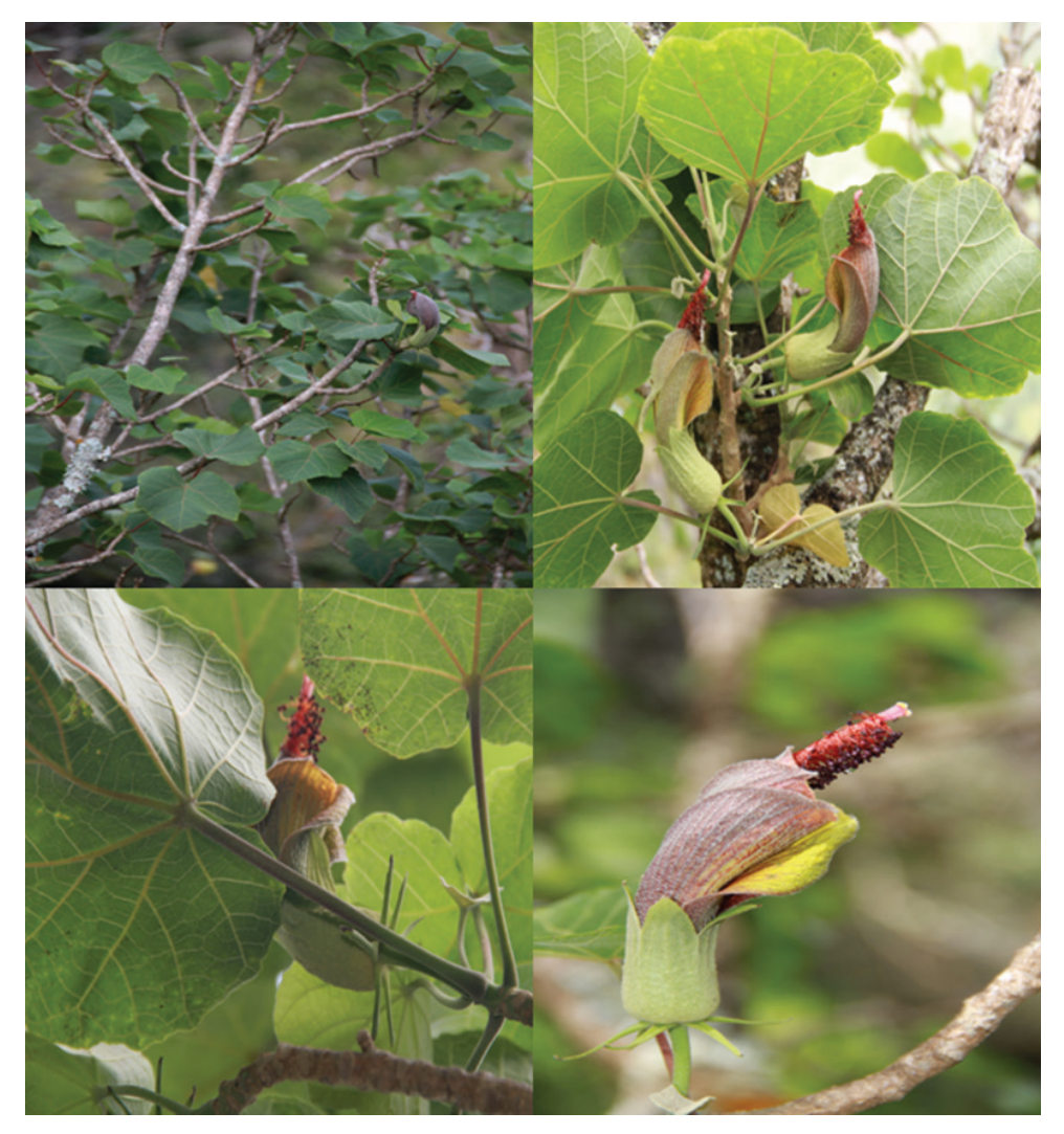
Figure 1. Hibiscadelphus stellatus. A Habit B Flowers and leaves (from the holotype) C View of bracts illustrating stellate arrangement D Close-up of flower. (from the holotype).

concealed portion yellow, conspicuously veined, densely covered with gray or tan stellate trichomes especially along veins, internally yellow or purple-tinged distally, purple toward base, corolla usually becoming purplish with age, staminal column and apex of the style exserted for 1.5–2.5 cm; staminal column 8–8.5 cm long, antheriferous in distal 3.5 cm, maroon-purple, antheriferous in distal 3.5 cm, stamens c. 100, anthers reniform-curved, 0.8–1.5 mm long, purple, filaments 6–12 mm long, purple, pollen grains purple turning golden yellow after anther dehiscence; style 8.5–9 cm long, style branches 3–5 mm long, villose, stigmas rounded, c. 1 mm long, yellow, ovary dome-shaped, 8 mm long and wide. Fruit a woody capsule, globose-cuboid to -ovoid,