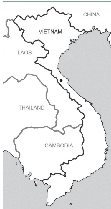
Figure 3. Distribution (dot) of Aristolochia quangbinhensis T.V. Do in Central Vietnam.

the loss of large extensions of primary forest. Although logging was prohibited in the 1990s, local farmers continued to impose strong pressure on the remaining forest patches converting it mostly into corn and soybean fields. As a result, the flora of the area should be regarded as threatened by extinction. Within the area, A. quangbinhensis is known from a single population; in fact, during the present study, only two healthy individuals were located growing about 50 m apart from each other. Therefore, the new species is assigned a preliminary status of vulnerable (VU D2) according to IUCN Red List criteria (IUCN 2013), indicating a population with a very restricted area of occupancy (typically less than 20 km 2 ) or the number of locations (typically five or fewer) being both at hand for A. quangbinhensis . The lack of data currently does not allow a final risk evaluation, but the species might also be regarded as endangered (EN).