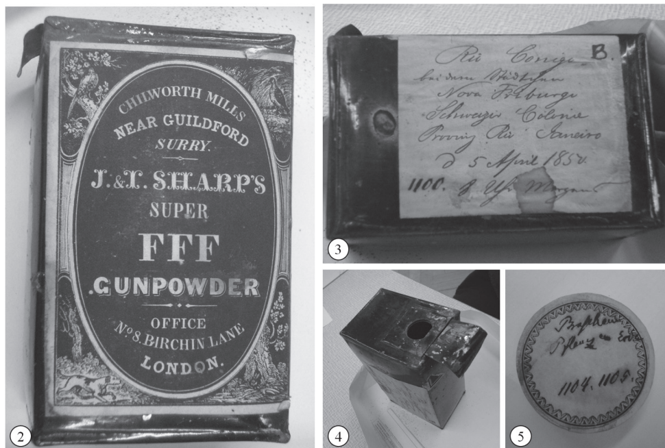
Figure 2–5. General storage of samples from Brazil in Ehrenberg Collection, Museum für Naturkunde 2–4 Gunpowder boxes 2–3 Lateral view 4 View from the top 5 Medicine box

Pinnularia microstauron (Ehrenb.) Cleve, Acta Soc. Fauna Fl. Fenn. 8(2): p. 28. 1891 http://species-id.net/wiki/Pinnularia_microstauron