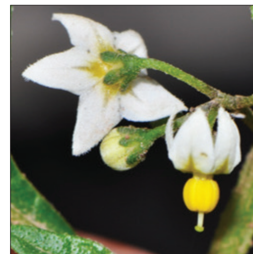
Solanum pseudoamericanum Särkinen, P. Gonzáles & S. Knapp, sp. nov.