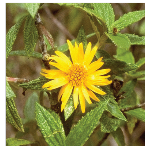
Bishopanthus soliceps H. Rob.