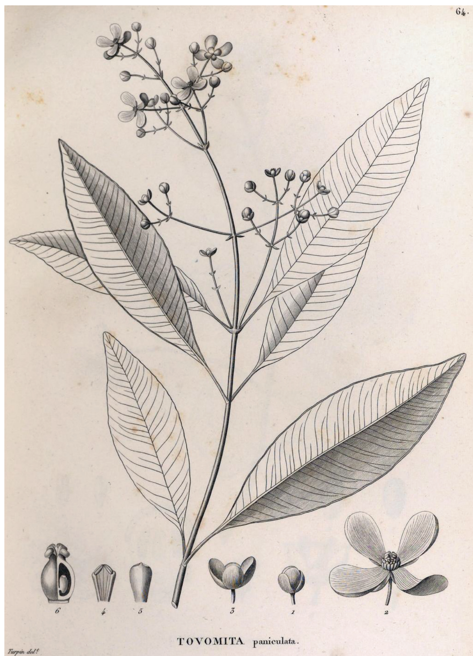
Figure 2. Illustration of Tovomita paniculata Cambess. published by Cambessèdes (1828) in “Flora Brasiliae Meridionalis”.