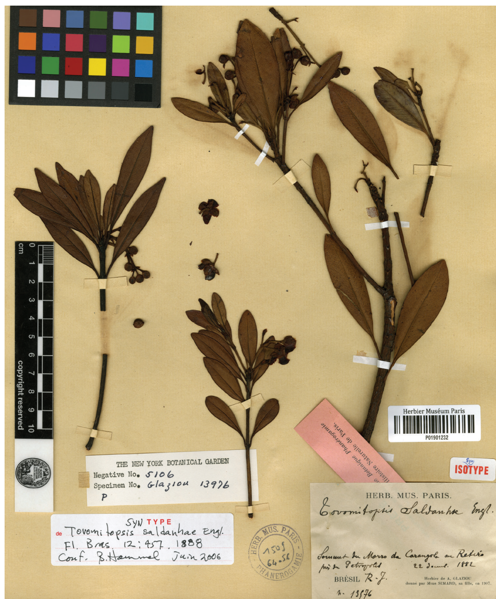
Figure 5. Lectotype of Tovomitopsis saldanhae Engl. (P01901232) housed at P.