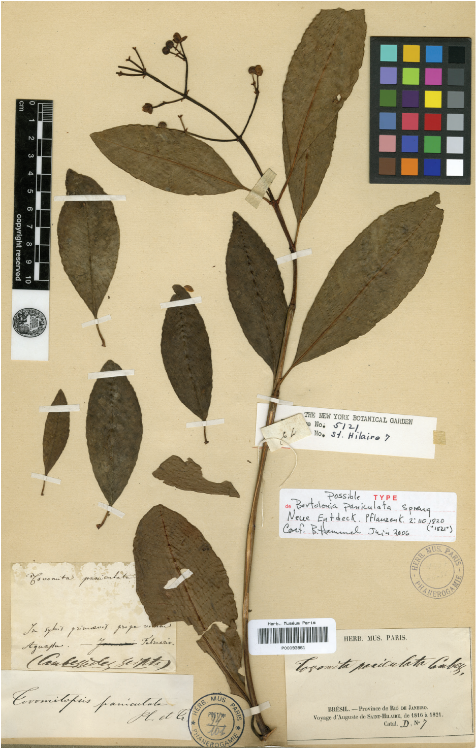
Figure 3. Lectotype of Tovomita paniculata Cambess. (P00093861) housed at P.