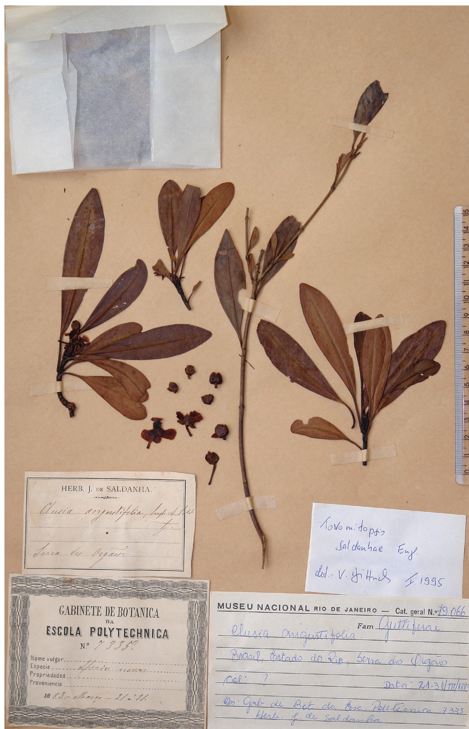
Figure 6. Lectotype of Clusia angustifolia Englm. housed at R. The long branch in the center belongs to a different species not yet identified.