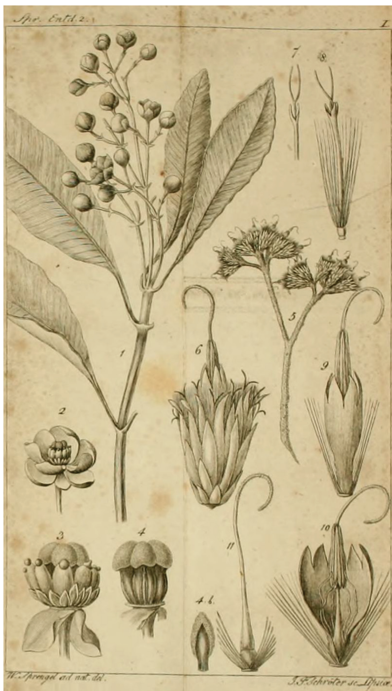
Figure 1. Lectotype (1–4b) of Bertolonia paniculata Spreng. (≡ Tovomitopsis paniculata (Spreng.) Planch. & Triana) published by Sprengel (1821) in “Neue Entdeckungen im ganzen Umfang der Pflanzenkunde II”.