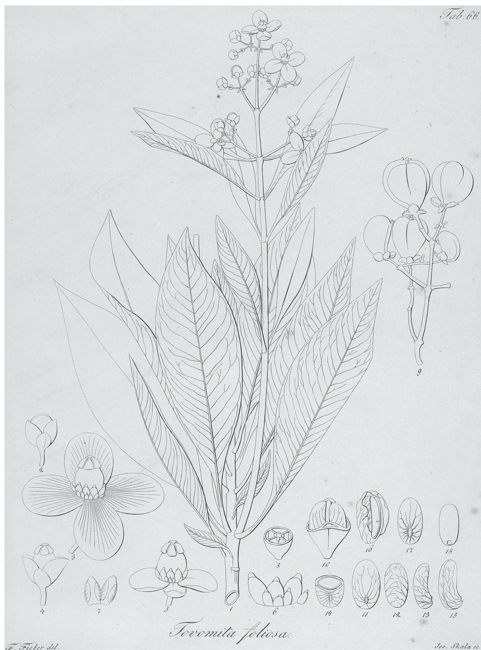
Figure 4. Lectotype of Tovomita foliosa C.Presl (= Tovomitopsis paniculata (Spreng.) Planch. & Triana) published by Presl (1834) in " Symbolae botanicae, sive, Descriptiones et icones plantarum novarum aut minus cognitarum ".