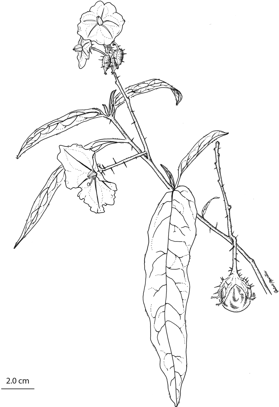
Figure 2. Illustration of Solanum watneyi . Mature branch with flowers and a developing fruit. Based on plant grown at Bucknell University from seeds of Martine and Martine 4065. Drawing by Rachel F. Martine.