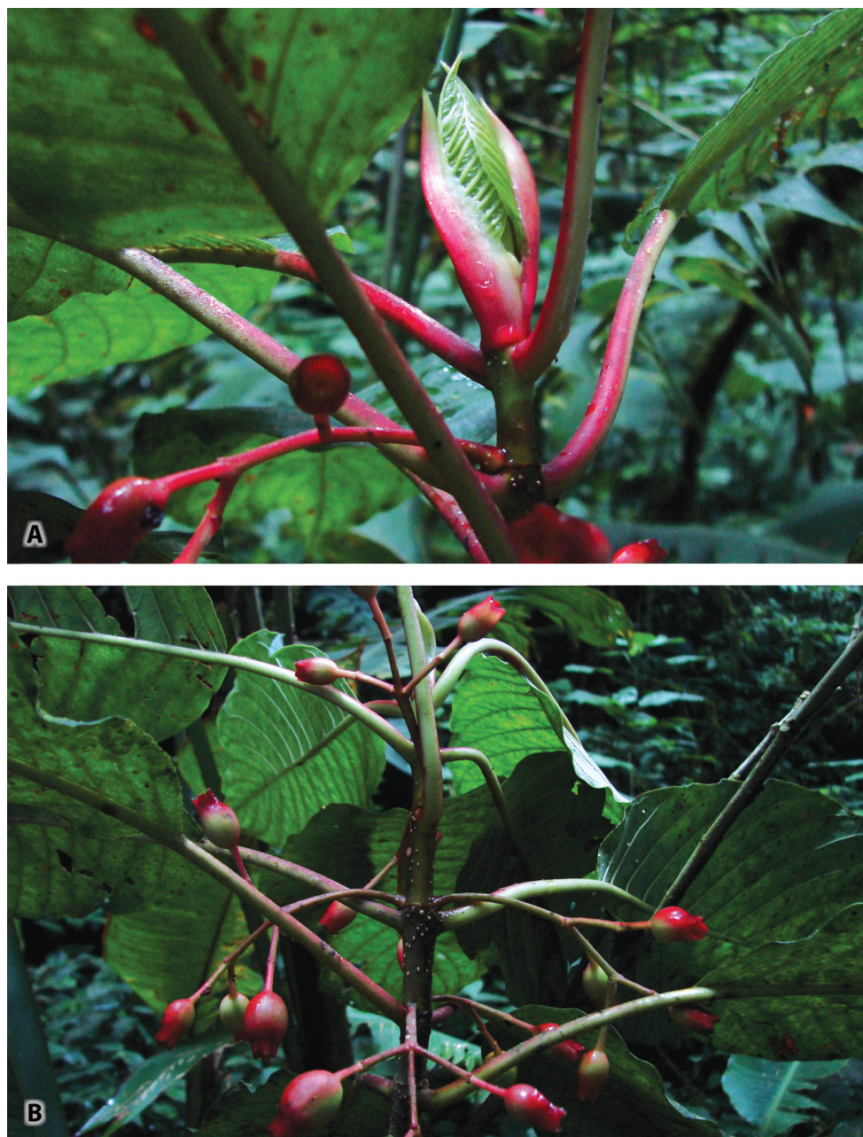
Figure 3. Sommeria cusucoana . A Tip of shoot with infructescence and leaf pair emerging between pair of stipules. Note red color of stipules, petioles, and infructescences B Freshly cut branch with inflorescence and infructescences. Photos by A.C. Dietzsch, 5 July 2013.