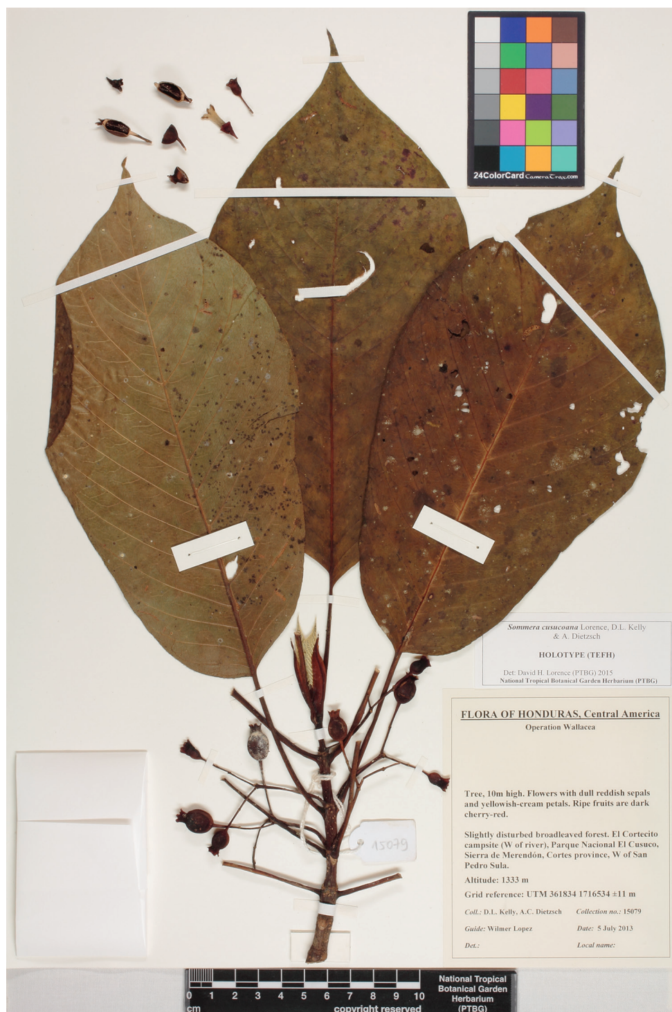
Figure 2. Scan of Holotype specimen of Sommeria cusucoana (to be deposited at TEFH).