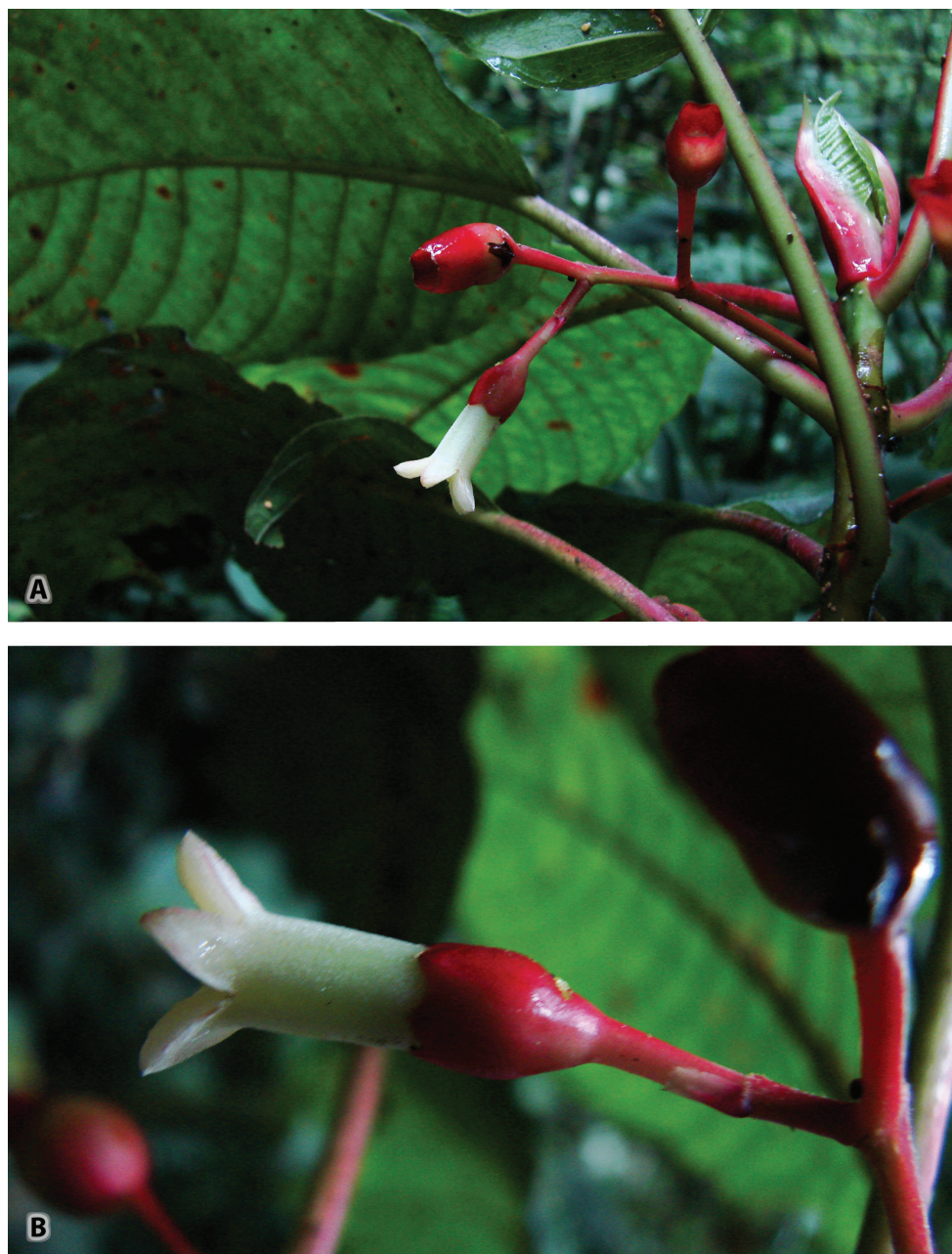
Figure 4. Sommeria cusucoana . A Tip of shoot with flower, developing fruits, and leaf pair emerging between pair of stipules B Flower at anthesis and developing fruit (appearing dark because in shadow). Photos by A.C. Dietzsch, 5 July 2013.