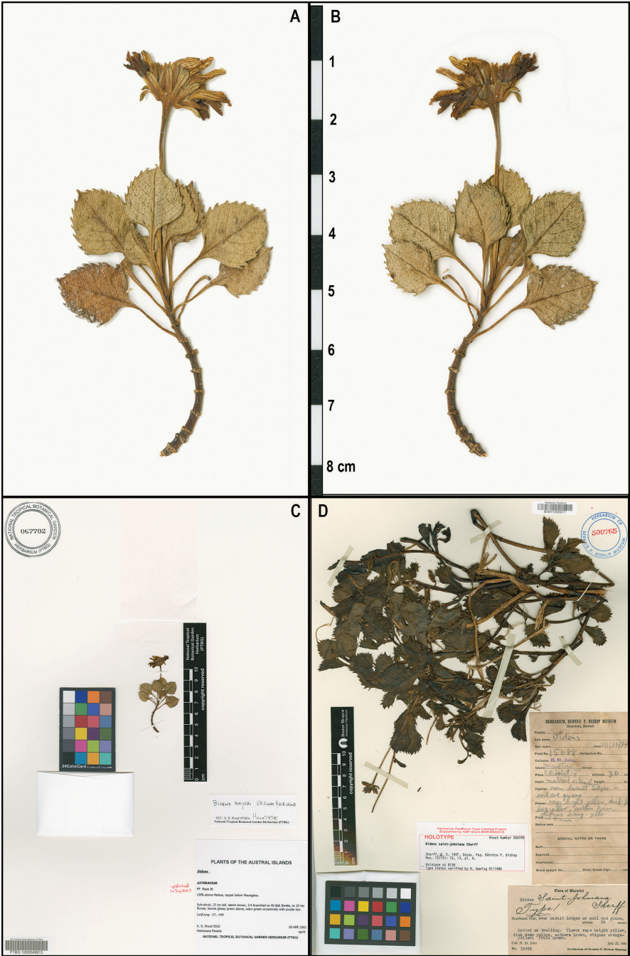
Figure 2. Photos of Bidens type specimens: A–C Bidens meyeri holotype (PTBG): A–B Specimen before mounting A Side with the involucral bracts and (mostly) upper surface of the leaves showing B Side with the flowers and (mostly) the undersurface of leaves showing C Holotype of Bidens meyeri , housed at PTBG D Holotype of Bidens saint-johniana , housed at BISH.