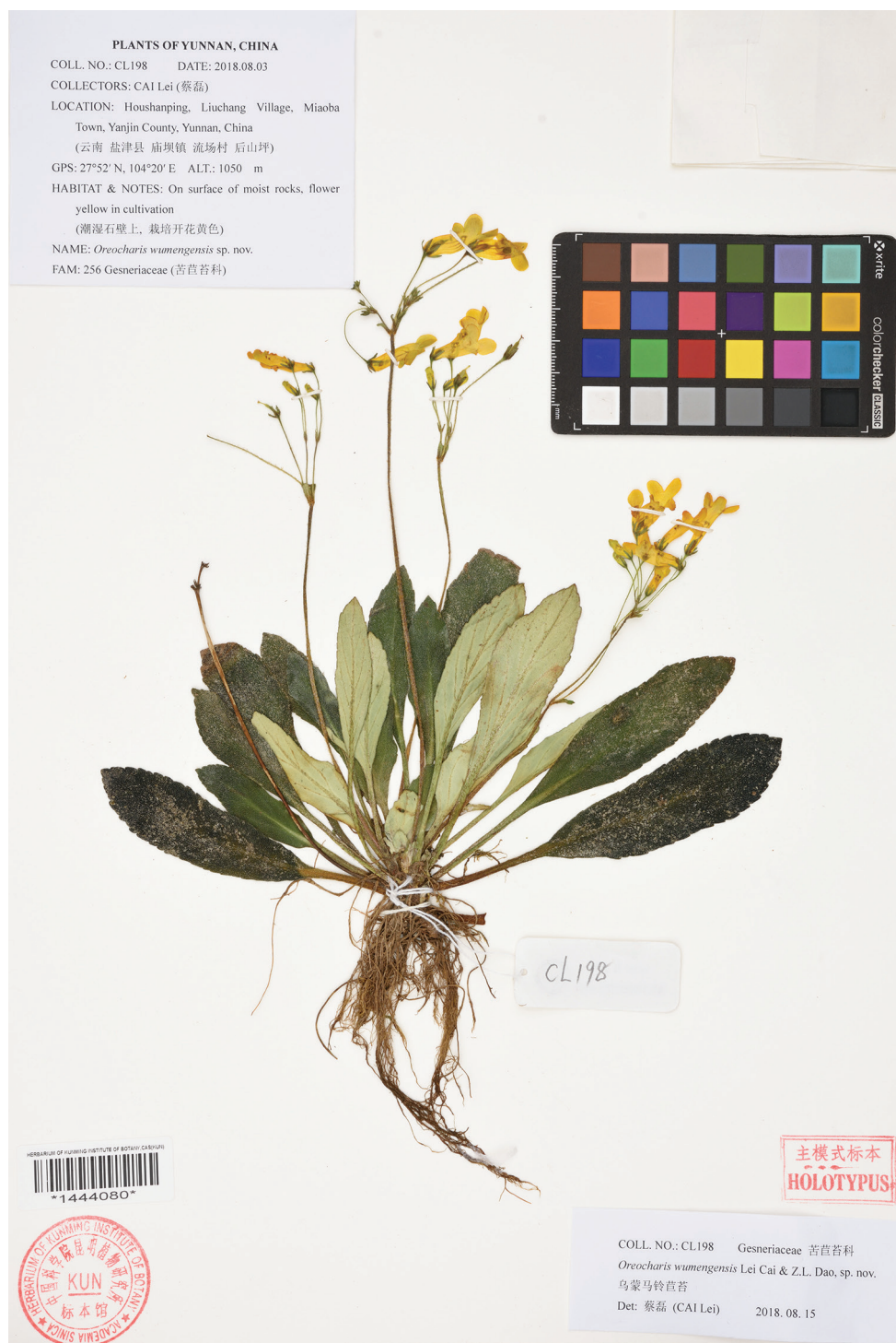
Figure 2. Holotype of Oreocharis wumengensis Lei Cai & Z.L.Dao, sp. nov. (KUN-1444080).