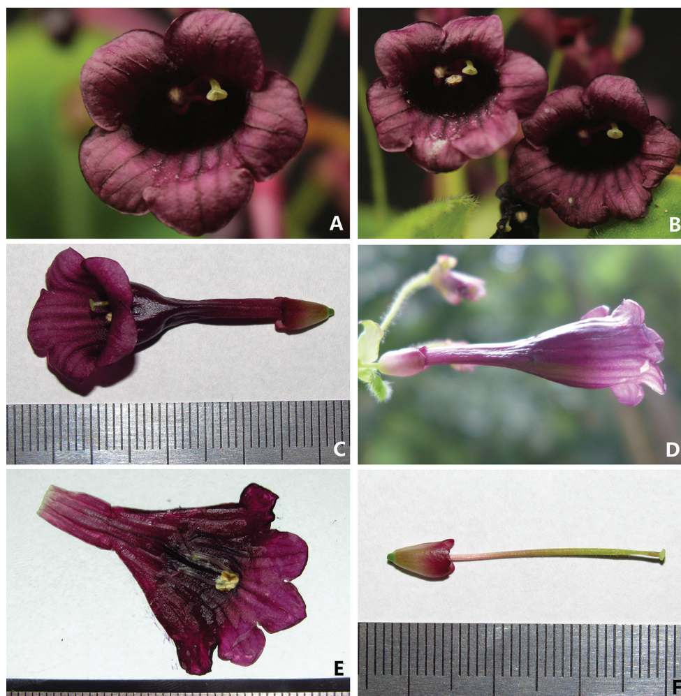
Figure 2. Flower of Didymocarpus puhoatensis X.Hong & F.Wen A–B Frontal view of corolla, showing the disc-like stigma C Top view of corolla D Upward view of corolla E Opened corolla, showing stamens and staminodes F Pistils without corolla.

cuneate, margin finely serrate or finely doubly serrate, papery, upper surface densely covered with whitish multicellular eglandular hairs, green, lower surface sparsely covered with hairs as on upper surface, pale green, venation pinnate, secondary veins 4–8 on each side of midrib, mostly opposite sometime alternate, obscure above, prominent beneath, covered with whitish multicellular eglandular hairs. Inflorescences terminal or from the upper leaf axils, cymose, ca. 12 cm long, 4–10 (–30) flowered; peduncles slender, 6–10 cm long, light green, sparsely covered with multicellular glandular hairs; pedicels 1–1.5 cm long, pale green, with indumentum as on the peduncle. Bracts paired, orbicular, ca. 5 mm long and wide, green to pale purple, glabrous. Calyx consisting of a tube and shallowly 5-lobed margin, symmetrical, campanulate, 6 mm long, glabrous, somewhat tawny to pinkish purple, tube ca. 5 mm long, 3 mm in diameter;