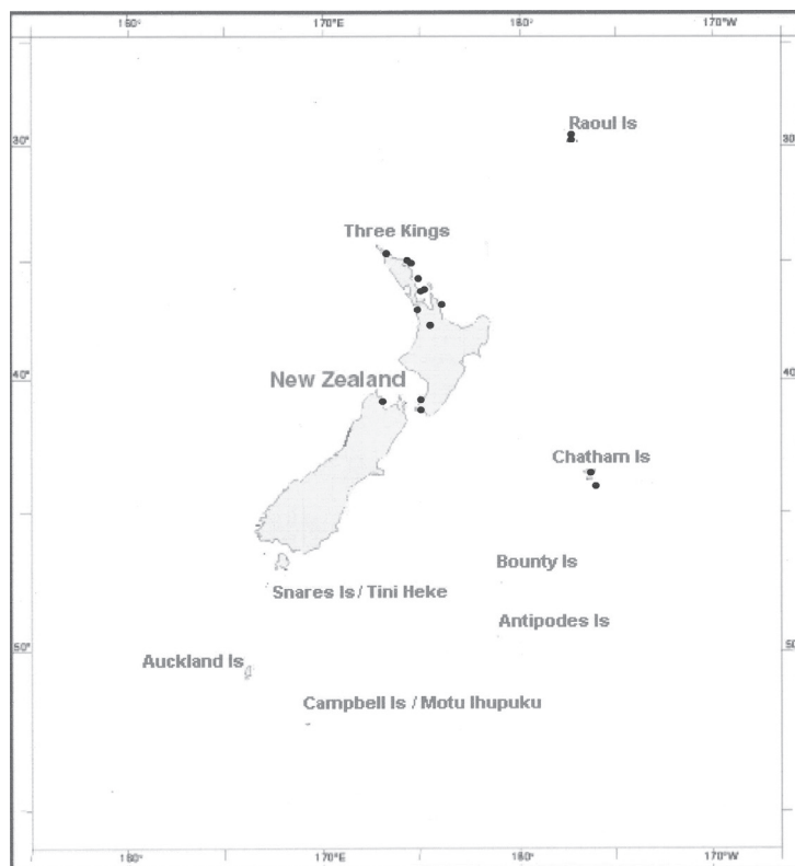
Figure 4. Indicative distribution. This map shows the known distribution of Lejeunea hodgsoniana .

Bryophyte associates have included Archilejeunea olivacea , Codonoblepharon minutus , Cololejeunea minutissima , Fabronia australis , Racopilum sp., Frullania monocera , Frullania patula , Frullania pentapleura , Frullania rostellata , Lejeunea colensoana , Lejeunea helmsiana , Lejeunea oracula , Lejeunea primordialis , Lepidolaena taylorii , Lopholejeunea colensoi , Metalejeunea cucullata , Metzgeria furcata , Neckera hymenodonta , Rhynchostegium muriculatum , Siphonolejeunea nudipes , Syntrichia papillosa , Tetraphidopsis pusilla and Thuidium sparsum .