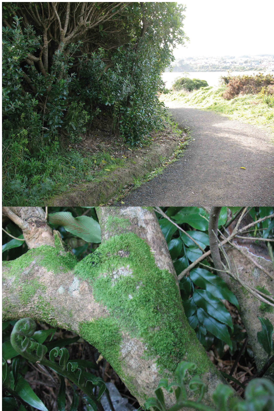
Figure 3. Type locality. Above. Regenerating native coastal bush. Below. Trunk of Melicytus ramiflorus showing the extensive mats of Lejeunea hodgsoniana resulting from confluent growth.