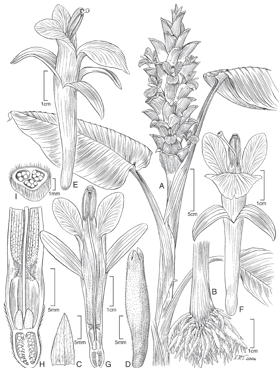
Figure 2. Curcuma arracanensis W.J.Kress & V.Gowda. A Habit of flowering plant B Tuberos rhizome C Ligule D Bracteole E Flower, lateral view F Flower, frontal view G Flower, cut-away view showing style and anthers H Base of flower, cut-away view showing style, epigynous nectaries and placentation I Placentation, cross section. WJK 03-7328 (US).

living collection cultivated at the Smithsonian Botany Research Greenhouses as US-BRG 1997–141, 29 September 2011, W. J. Kress, V. Gowda & M. Bordelon 11–8809 (holotype: US! [US 3635561, barcode 00940954; isotypes RAF!, E!).