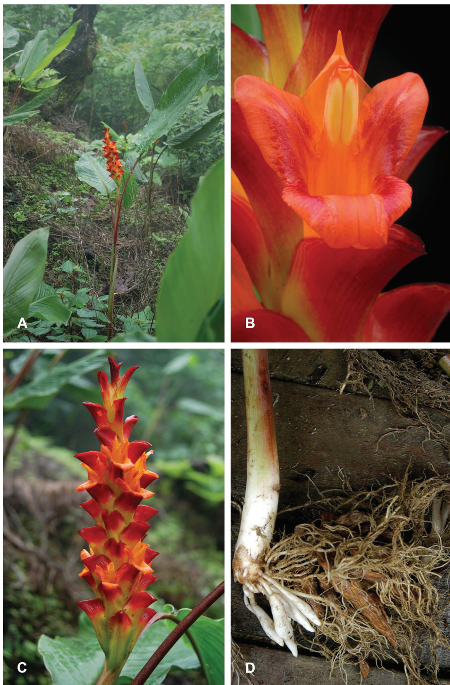
Plate 2. Curcuma arracanensis W.J.Kress & V.Gowda. A Habit B Flower, frontal view C Inflorescence D Rhizome. WJK 03-7328 (US).