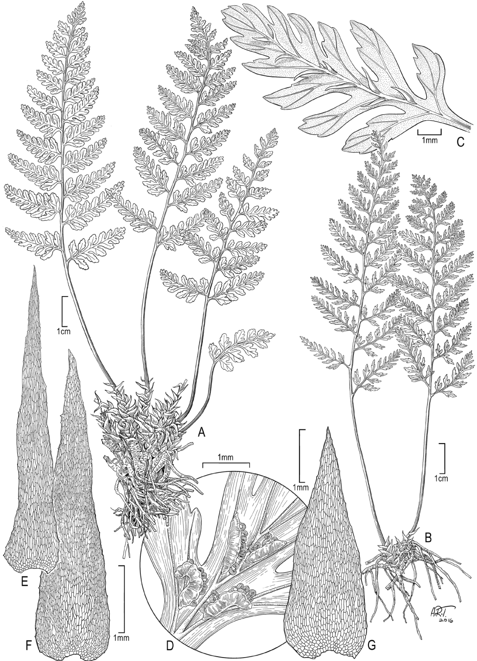
Figure 1. Athyrium haleakalae K.R. Wood & W.L. Wagner. A–B habit C detail of adaxial pinnule showing venation and fleshy spines D detail of abaxial pinnule showing range of sori shapes E–F lower stipe scales G rhizome scale. A–G from Perlman et al. 23964 (BISH, PTBG, UC, US) (Illustration by Alice Tangerini).