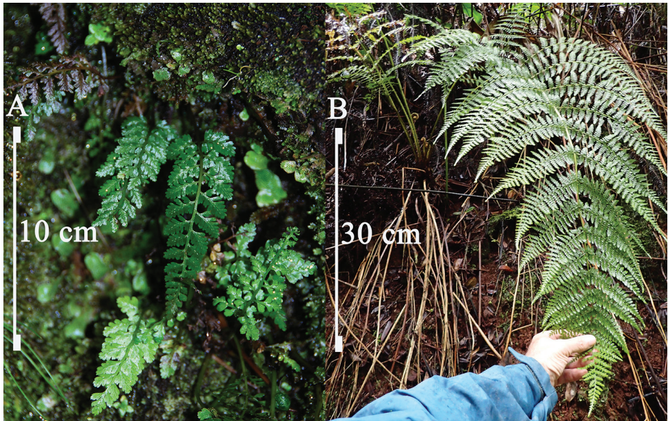
Figure 4. A Mature plants of Athyrium haleakalae , showing habitat preference along concave hollow of stream, Hana Forest Reserve, East Maui, HI (22 Aug 2013, Wood & Oppenheimer 15639) B Mature plant of Athyrium microphyllum , showing terrestrial habitat preference, erect rhizome, and large size, Mohihi, Kaua'i, HI (18 Dec 2014, Wood & Flynn et al. 16175).

(Figures 3, 4A). These stream sites average ca. 10–15 m broad and have exposed basalt bedrock and large strewn boulders. Associated ferns occurring with A. haleakalae include Athyrium microphyllum , Cyclosorus sandwicensis (Brack.) Copel. (Thelypteridaceae), Selaginella arbuscula (Kaulf.) Spring (Selaginellaceae), and Hymenasplenium unilaterale (Lam.) Hayata and Vandenboschia davallioides (Gaudich.) Copel. (both Hymenophyllaceae). Significantly, A. haleakalae grows in association with one of the rarest Hawaiian endemic rheophytes, Cyclosorus boydiae (D.C. Eaton) W.H. Wagner.