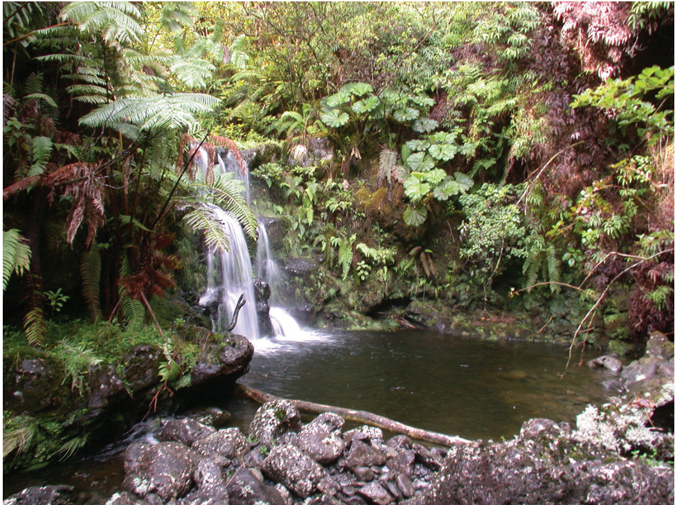
Figure 3. Typical habitat of Athyrium haleakalae around stream plunge pools, Hana Forest Reserve, East Maui, HI. Photo by K.R. Wood, 21 Aug 2013.

bination of its small size, remoteness of preferred habitat, and the extreme physical geography of its surroundings can explain why A. haleakalae has been overlooked to date. Modern access by helicopter and careful floristic inventories around large waterfalls and rugged plunge pools have led to its recent discovery by botanists of the National Tropical Botanical Garden (NTBG), the Maui Nui Plant Extinction Prevention Program (PEPP), and Haleakalā National Park. It is believed that the extent of occurrence for A. haleakalae may be greater than the four drainages reported here, and further research into similar habitats along adjacent drainage basins could lead to the discovery of additional colonies.