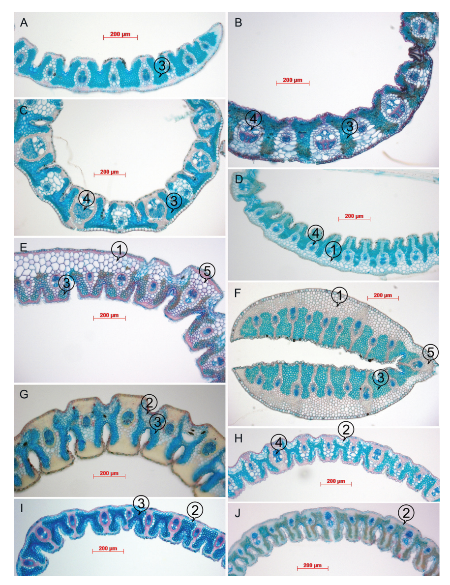
Figure 3. Leaf anatomy of Cortaderia , as evident from transverse sections. A C. egmontiana (Moore 2677) B C. modesta (Glaziou 17913) C C. hieronymi (Garcia 563) D C. nitida (Laegaard 53121) E C. boliviensis (Beck 11273); F C. sericantha (Ramsay 967); G C. echinata (Peterson 21587) H C. bifida (Renvoize 4202) I C. hapalotricha (Laegaard 53305) J C. roraimensis (Maguire 60448). Structures referred to in the descriptions are labelled as follows: 1, multi-layered abaxial sub-epidermal collenchyma layer; 2, adaxial islands of collenchyma in the abaxial grooves; 3, chlorenchyma; 4, primary vascular bundle; 5, midrib.

is sympatric with C. bifida , with which it is often confused: in both species the old leaf sheaths are lacerated and the spikelets have long awns, but the spikelets of C. hieronymi are bigger, and the lemmas with longer and robust central awns.