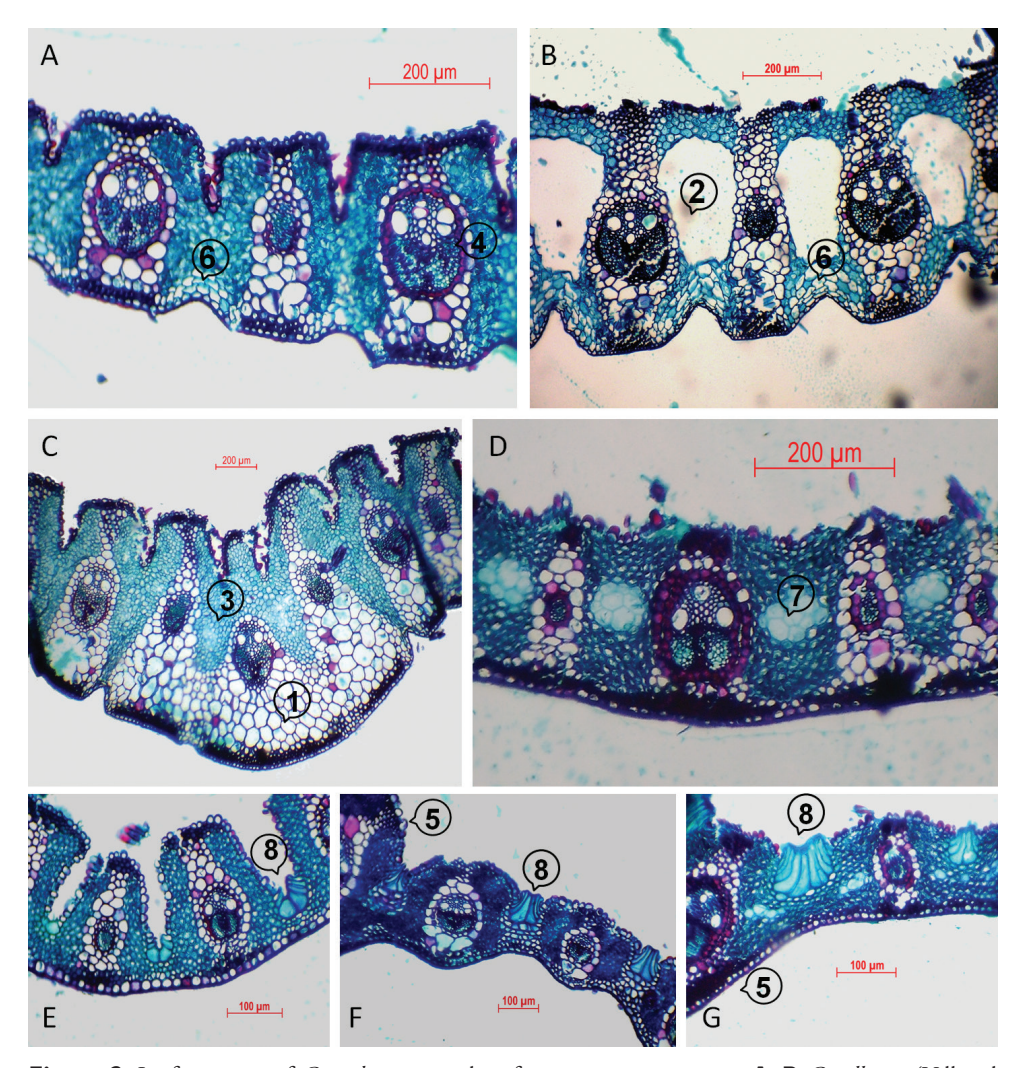
Figure 2. Leaf anatomy of Cortaderia , as evident from transverse sections. A–B C. selloana (Villamil 11738) C C. speciosa (Testoni 644) D C. vaginata (Zanín 1654). Comparison of bulliform cells in Egmontiana group: E C. egmontiana (Testoni 634) F C. modesta (Carauta 927) G C. vaginata (Zanín 1654). Structures referred to in the descriptions are labelled as follows: 1, multi-layered abaxial sub-epidermal collenchyma layer; 2, aerenchyma; 3, chlorenchyma; 4, primary vascular bundle; 5, midrib; 6, colourless cells; 7, empty cells; 8, bulliform cells.

Taxonomy. Cortaderia selloana ssp. selloana can be diagnosed by the glumes about as tall as the basal lemma, and lemma without a distinct awn. The plants are generally larger than those of C. araucana and C. speciosa , and the panicles are larger (0.5 to 1 m long), more lax, and coloured white, pink or yellowish. The similar size of basal lemmas and glumes (6–15 mm) further separates it from C. araucana (glumes 9–17 mm long, ca. \frac{1}{2} length of basal lemmas), whereas the larger glumes separate it from C. speciosa (glumes 6–8 mm, ca. \frac{3}{4} length of basal lemmas). The large size may also